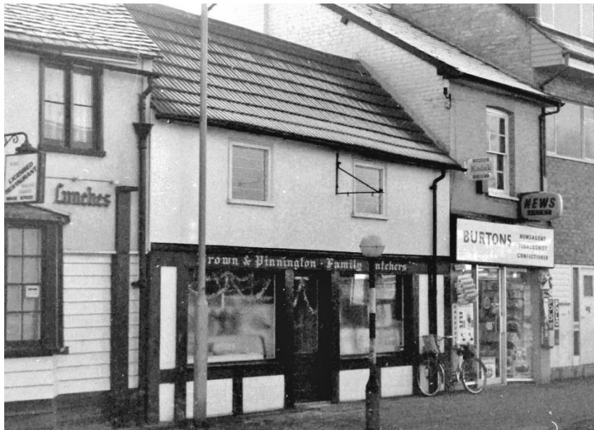
A 1973 picture of Burtons shop showing the newspapers in racks and a selection of vending machines including the green and white of the Polo mint machine on the far side of the shopfront.

For many years the Burtons were ably assisted by Mick and George. Their helpfulness and affability meant that they added considerably to the legendary status of the shop within the village community. During the time that Ken and Eva ran the shop it underwent a couple of expansions in size. This was achieved by progressively taking over the once storage room and residential accommodation to the rear of the shop. This led to a significant expansion of the retail offering including such things as toys, a wide range of magazines, processing of films for holiday snaps and much else. In connection with which for many years in the 1960s a Lyons Maid ice cream sign could be seen standing out on the pavement. Burtons was known widely for its excellent service to its customers even managing to deliver newspapers on those occasions the village was flooded.