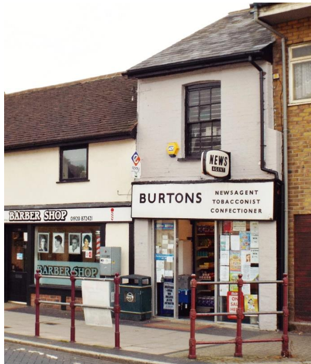
For comparison with the 1973 view above this colour view dates from 2013 and shows how remarkably little change had occurred to the shop frontage over a forty-year period.